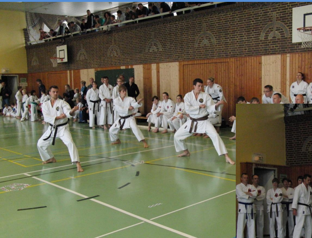
A few impressions of the Osaka Cup 2012, Germany