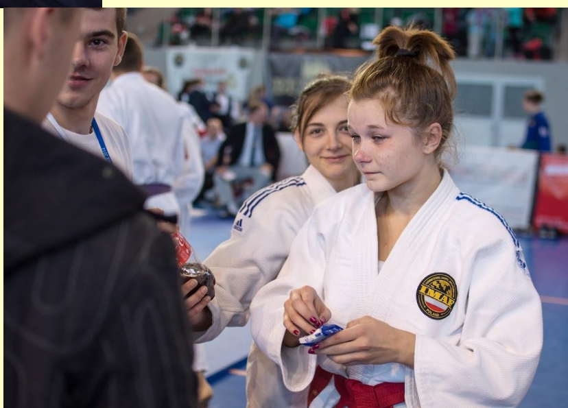
Joy and disappointment, Or just a cold