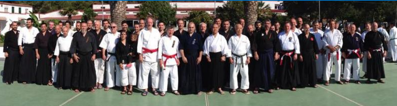
Thank you all for helping us from a magical Cala Montjoi