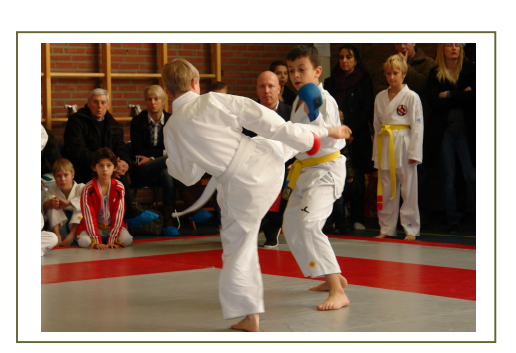
Why we keep doing what we do

As I did, many years ago, with the idea to learn, to participate. The learning part was great, but the participating part was not. An obstacle may have been the ancient hierarchical structure of Budo