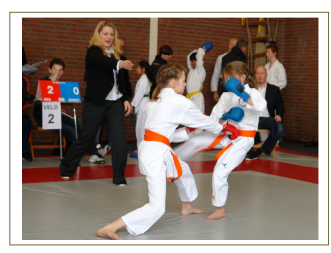
Small scale activities for the children